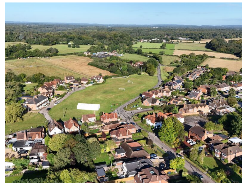
La Fosse, Fagnall Lane, Winchmore Hill, Amersham, Buckinghamshire, HP7 0PG