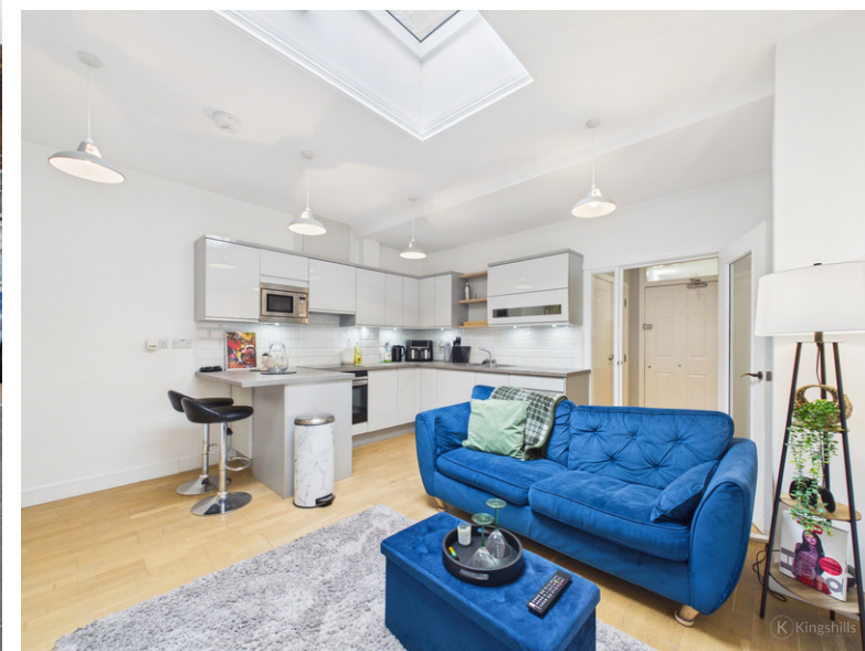
Flat 2, 24 High Street, High Wycombe, Buckinghamshire, HP11 2AG