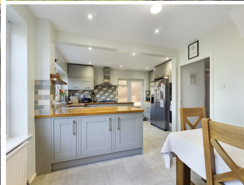
52 Kingsley Crescent, High Wycombe, Buckinghamshire, HP11 2UL