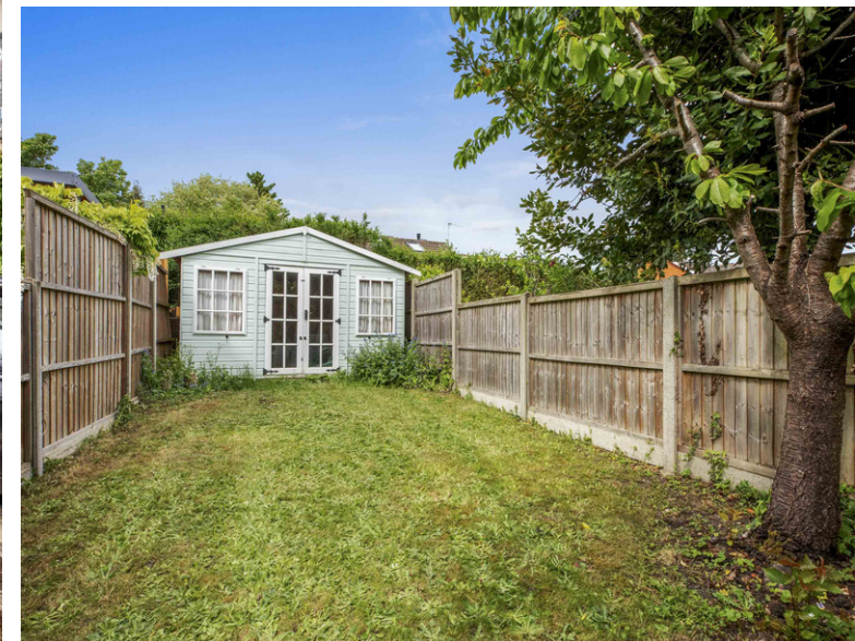
2 Mount Pleasant Cottages, Cores End Road, Bourne End, SL8 5AN