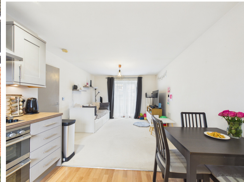
50 The Roperies, High Wycombe, Buckinghamshire, HP13 7FW