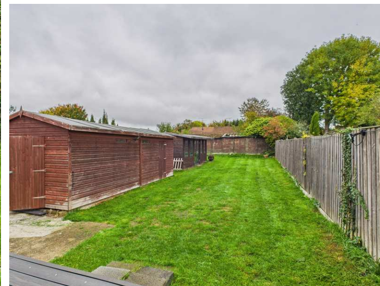
17 Tylers Road, Hazlemere, Buckinghamshire, HP15 7NS