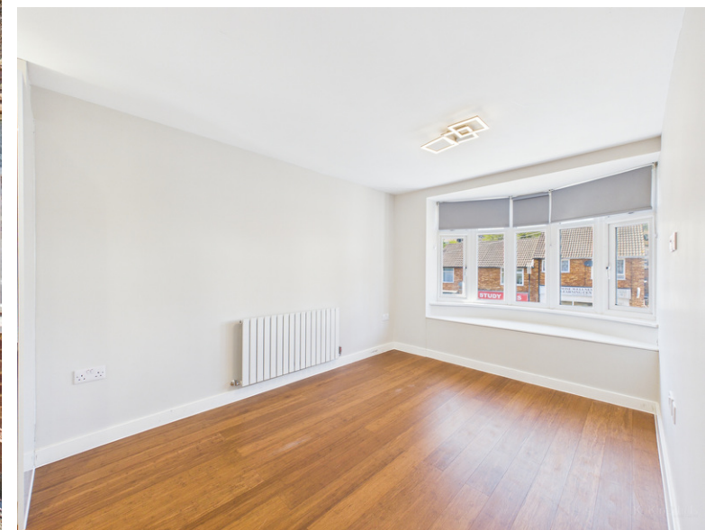
Flat 1, 11 Hillview Road, High Wycombe, Buckinghamshire, HP13 6XY