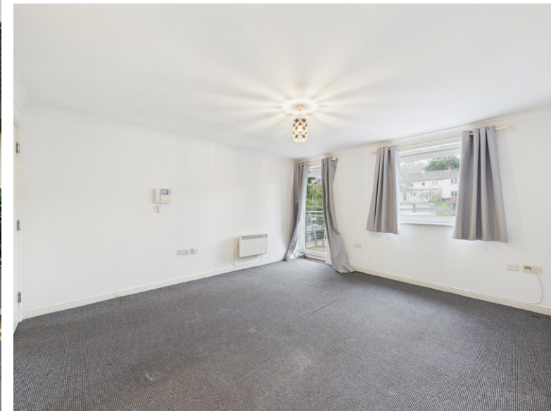
Flat 5 Kings View, West End Road, High Wycombe, Buckinghamshire, HP11 2PQ