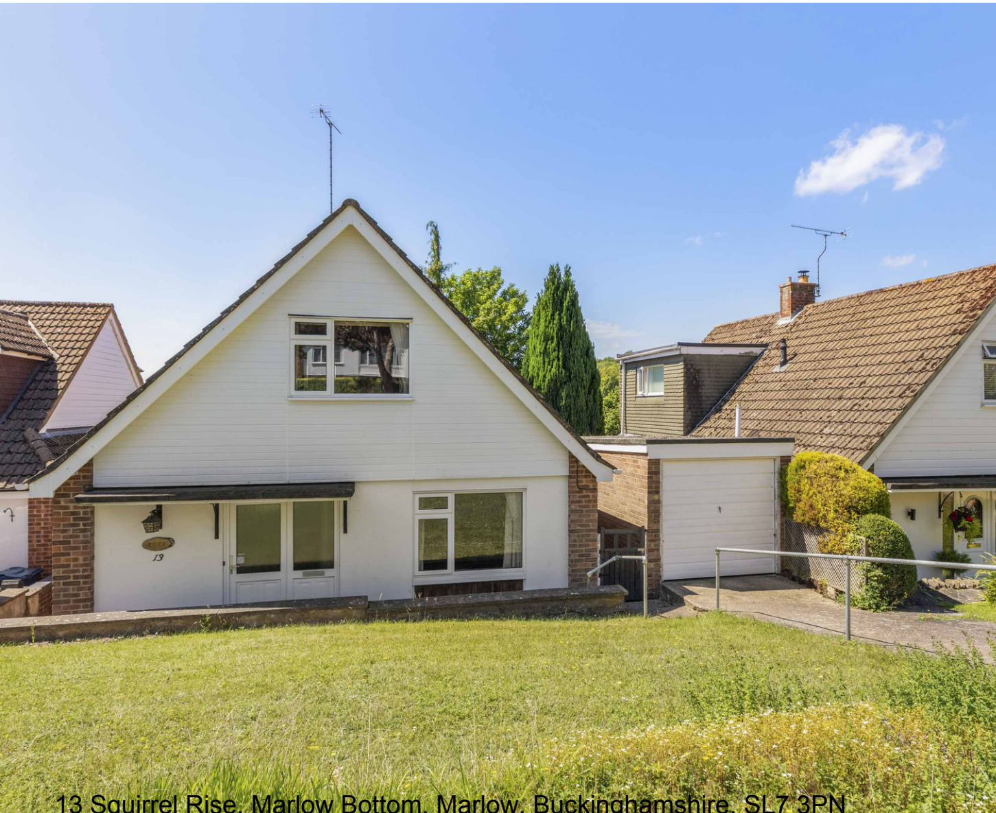
13 Squirrel Rise, Marlow Bottom, Marlow, Buckinghamshire, SL7 3PN