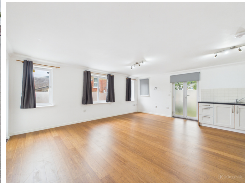
Flat 34 Peddle Court West End Road, High Wycombe, HP11 2AT