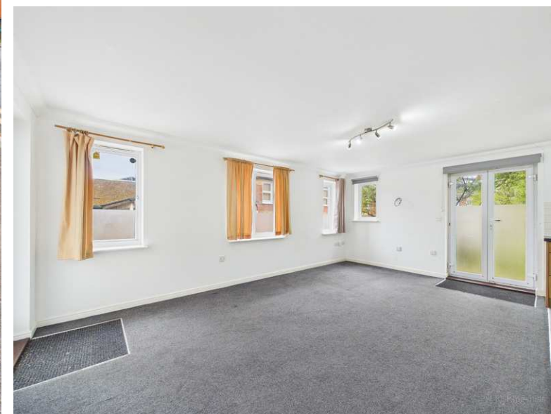
Flat 34 Peddle Court West End Road, High Wycombe, HP11 2AT