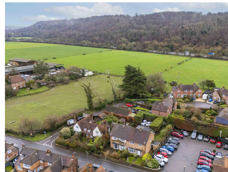
Badgers Rest, Marlow Road, Bisham Village, Bisham, Bucks, SL7 1RR