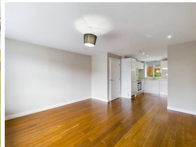
3 Westover Court, High Wycombe, Buckinghamshire, HP13 5JE