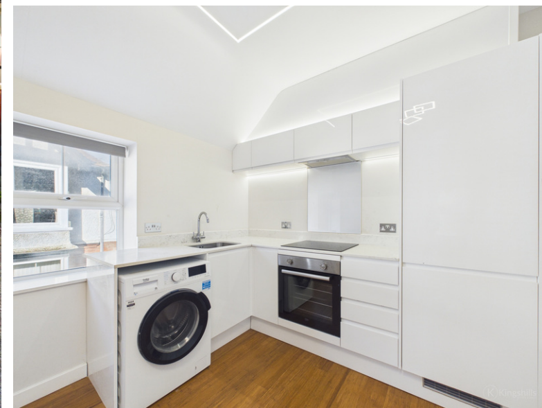
Flat 3, 222 West Wycombe Road, High Wycombe, Buckinghamshire, HP12 3AR