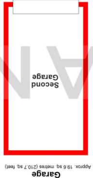
Garage Approx. 19.6 sq. metres (210.7 sq. feet)