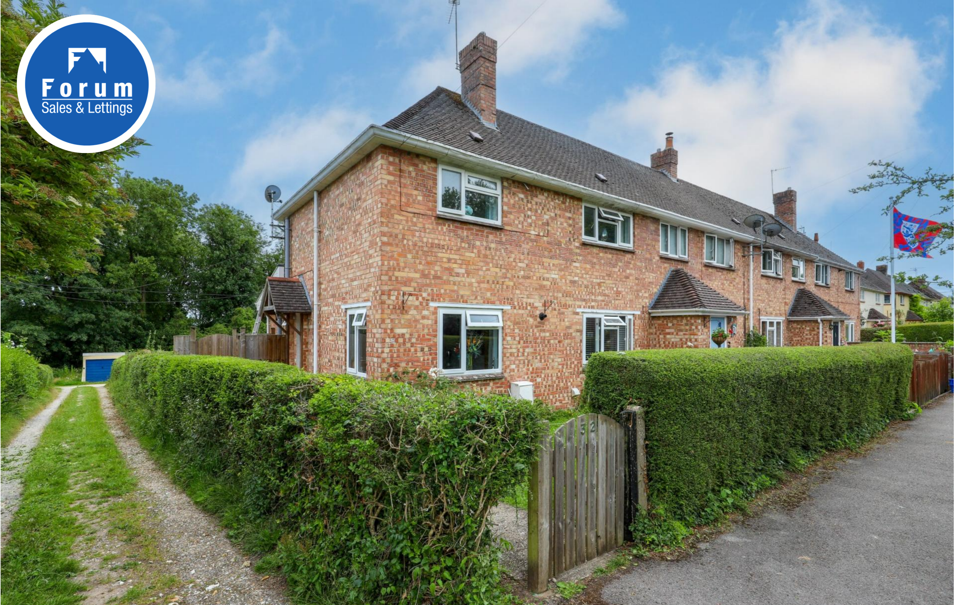
32 Forum View, Bryanston, Dorset, DT11 0PW