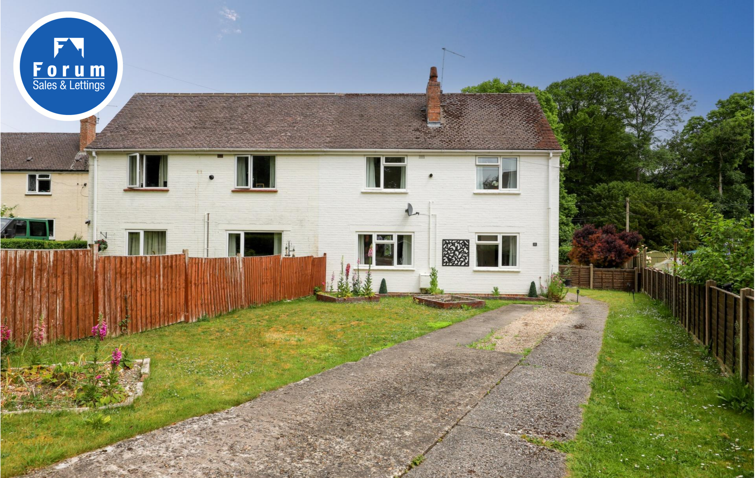
11 Forum View, Bryanston, Dorset, DT11 0PW