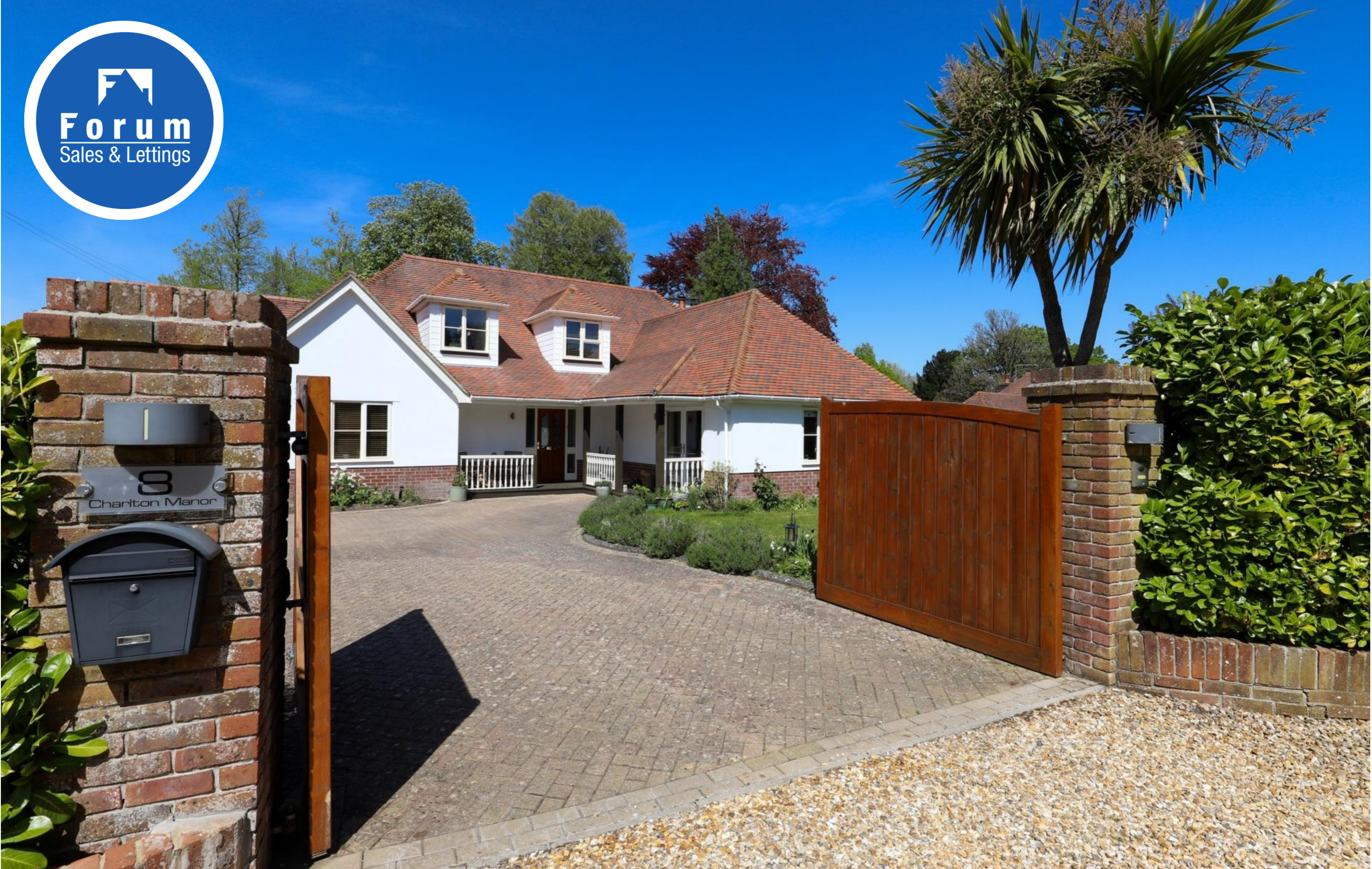
8 Charlton Manor, Charlton Marshall, Dorset, DT11 9NY