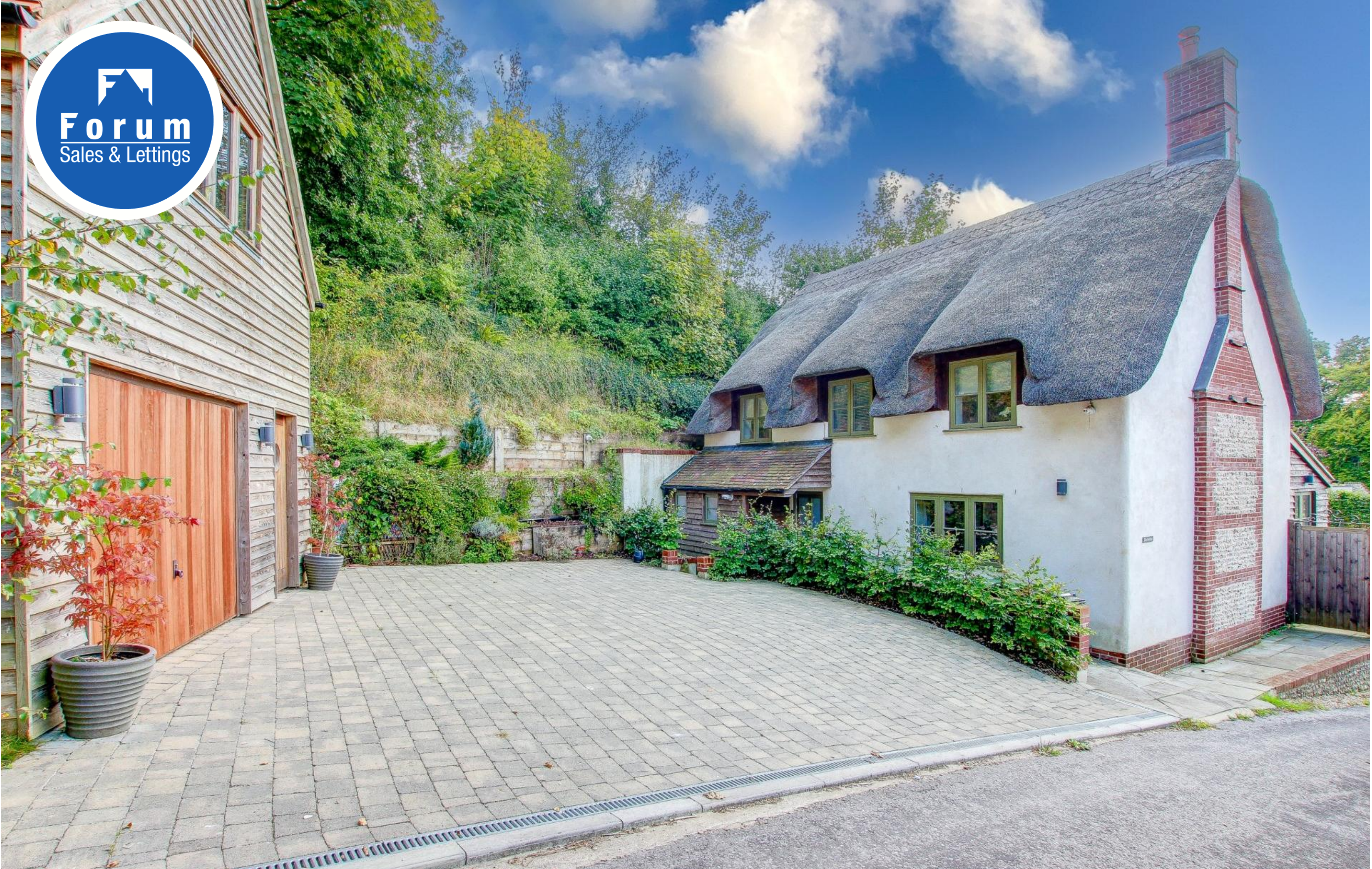
The Hollow, Chalky Path, Winterborne Stickland, Dorset, DT11 0NS