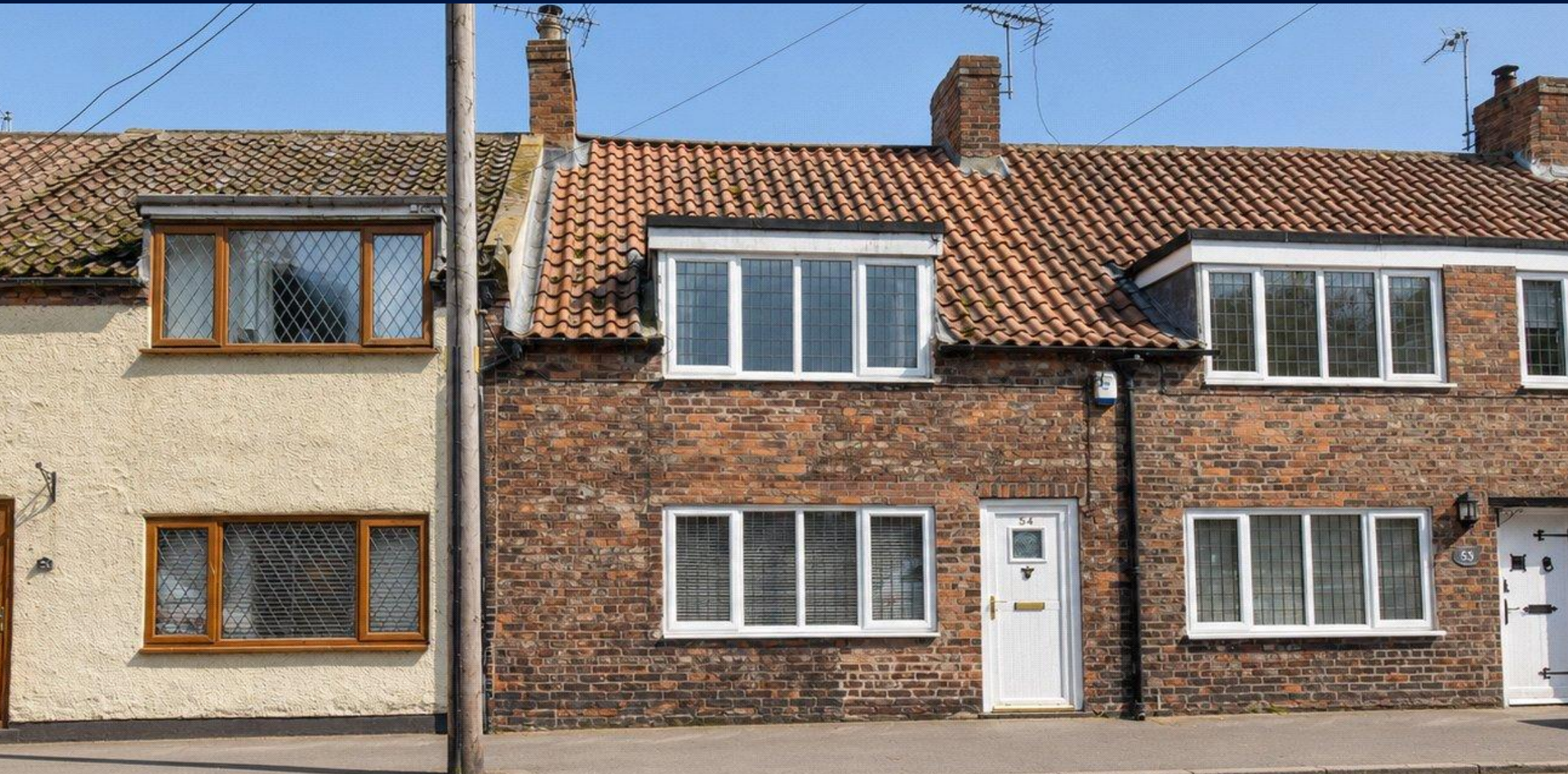
54 CHURCH VIEW, BROMPTON NORTHALLERTON, NORTH YORKSHIRE, DL6 2RD