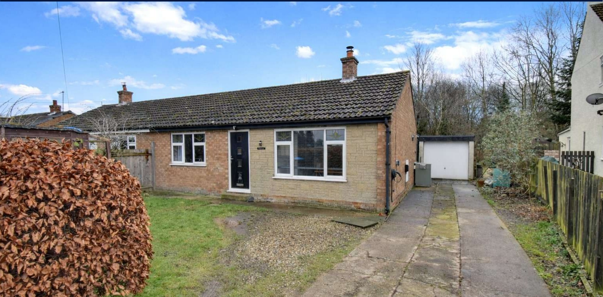
JENOR, RUSSELL TERRACE, LONDONDERRY NORTHALLERTON, NORTH YORKSHIRE, DL7 9LZ