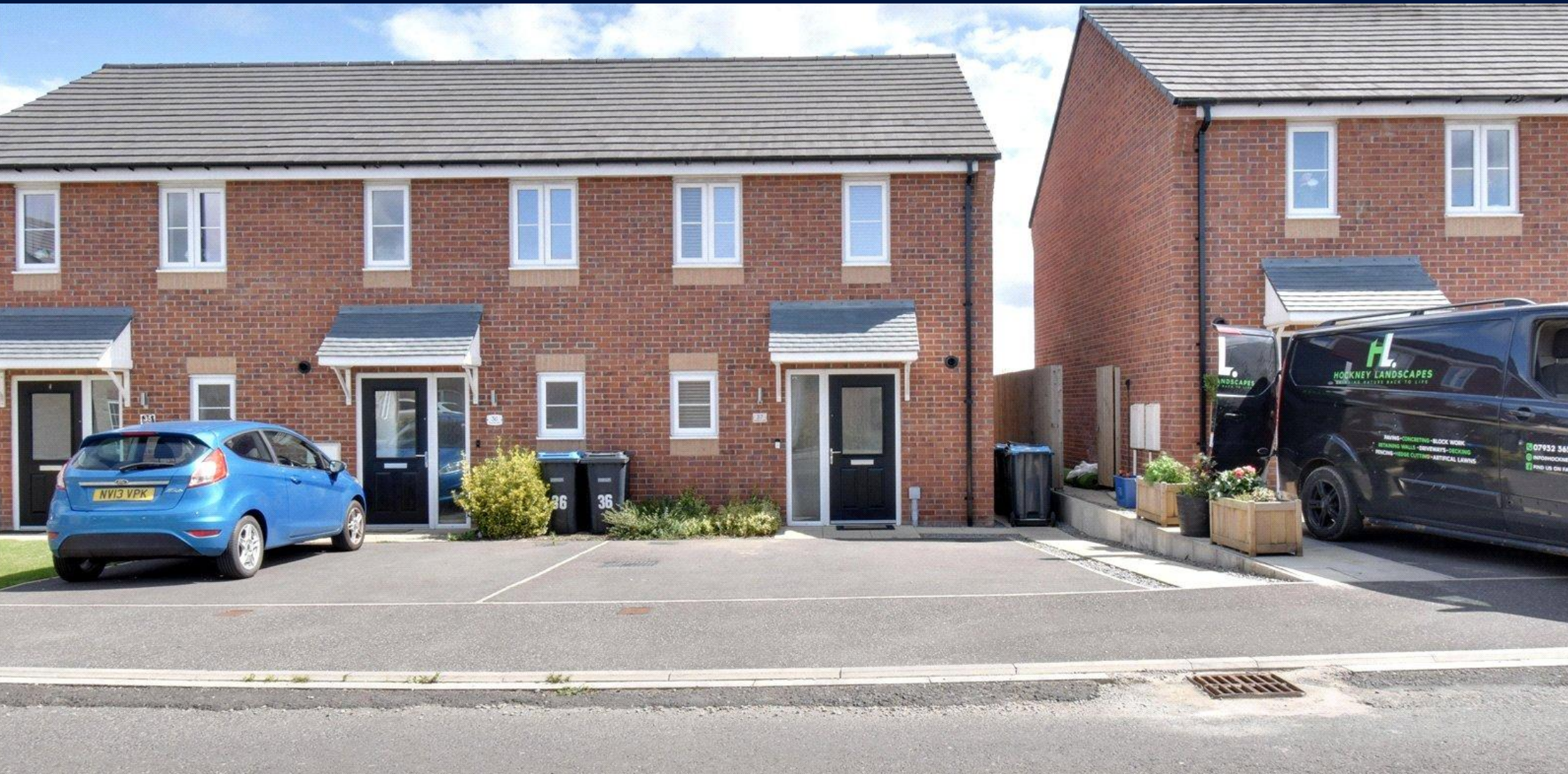
37 CARMELITE CLOSE, NORTHALLERTON NORTH YORKSHIRE, DL6 2FP