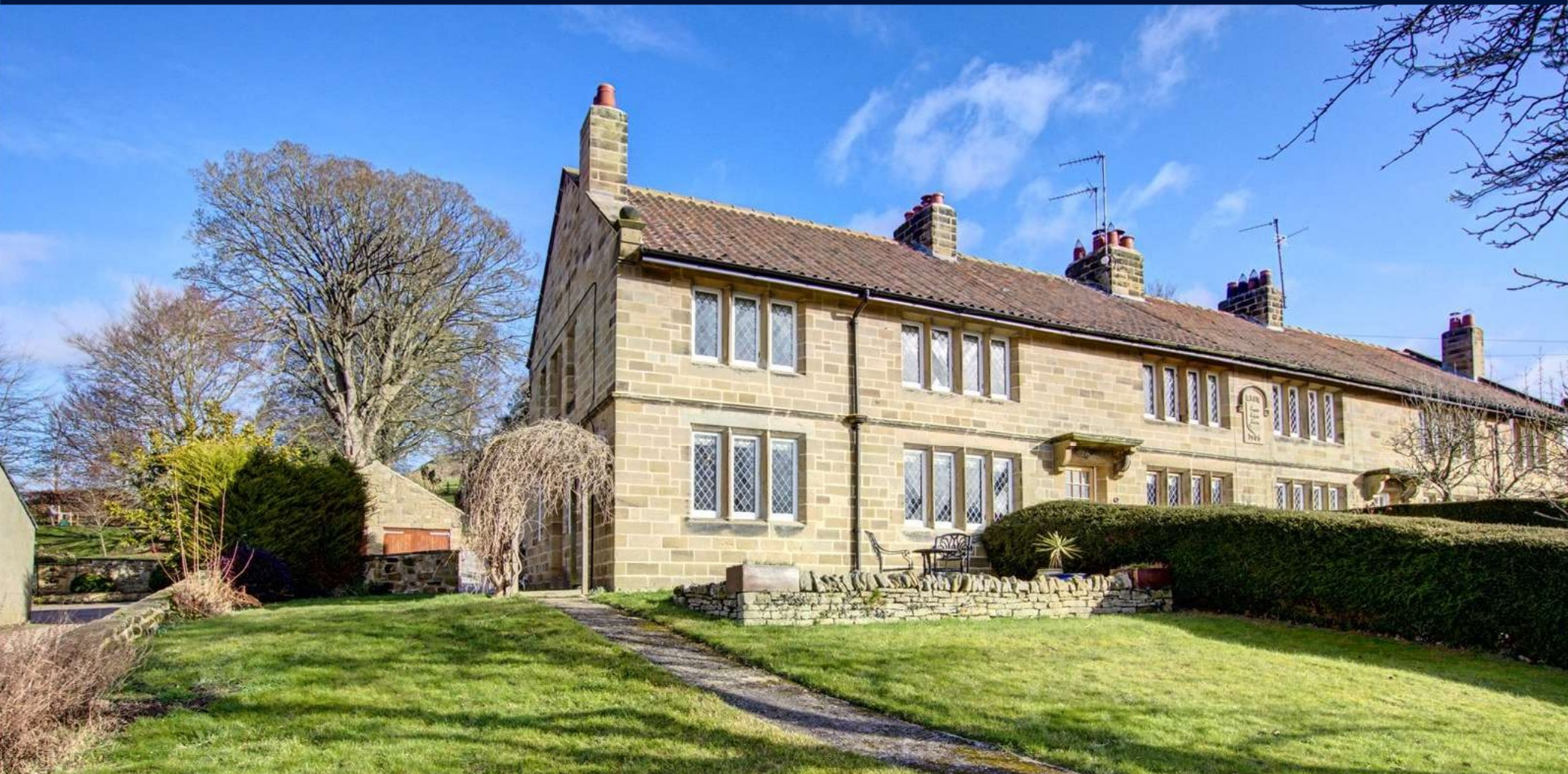
WEST HOUSE, COWESBY, THIRSK NORTH YORKSHIRE, YO7 2JL