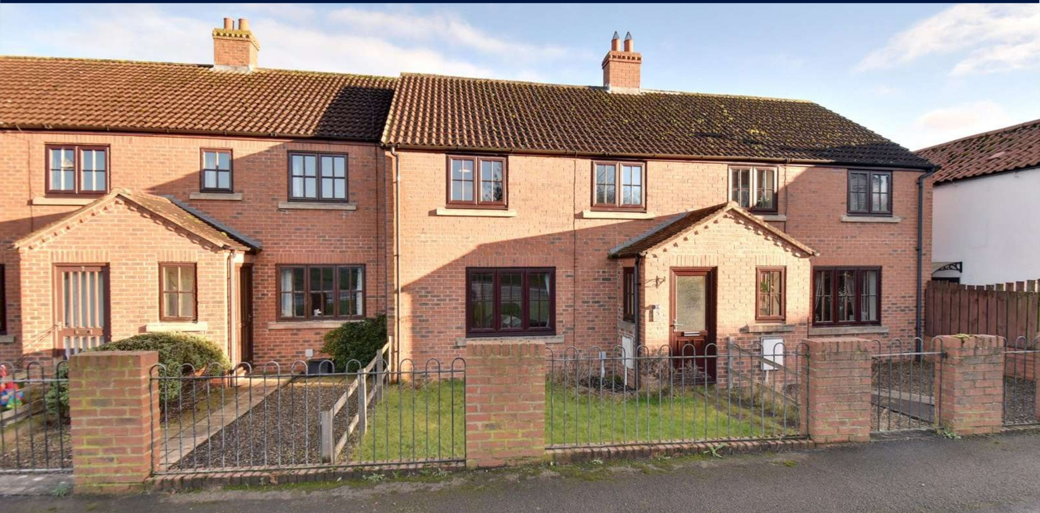
5 REVELLER MEWS, YAFFORTH NORTHALLERTON, NORTH YORKSHIRE, DL7 0NU