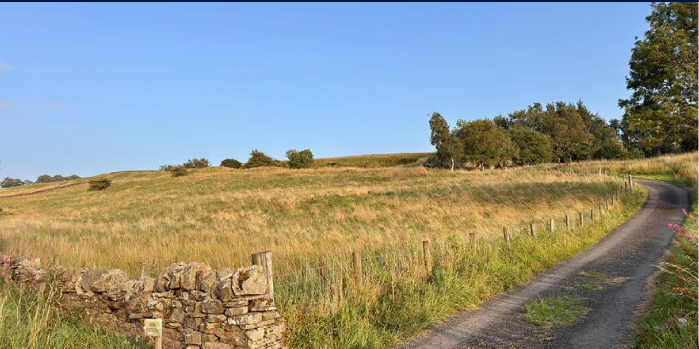
Land at the Milecastle Haltwhistle, Northumberland, NE49 9NN