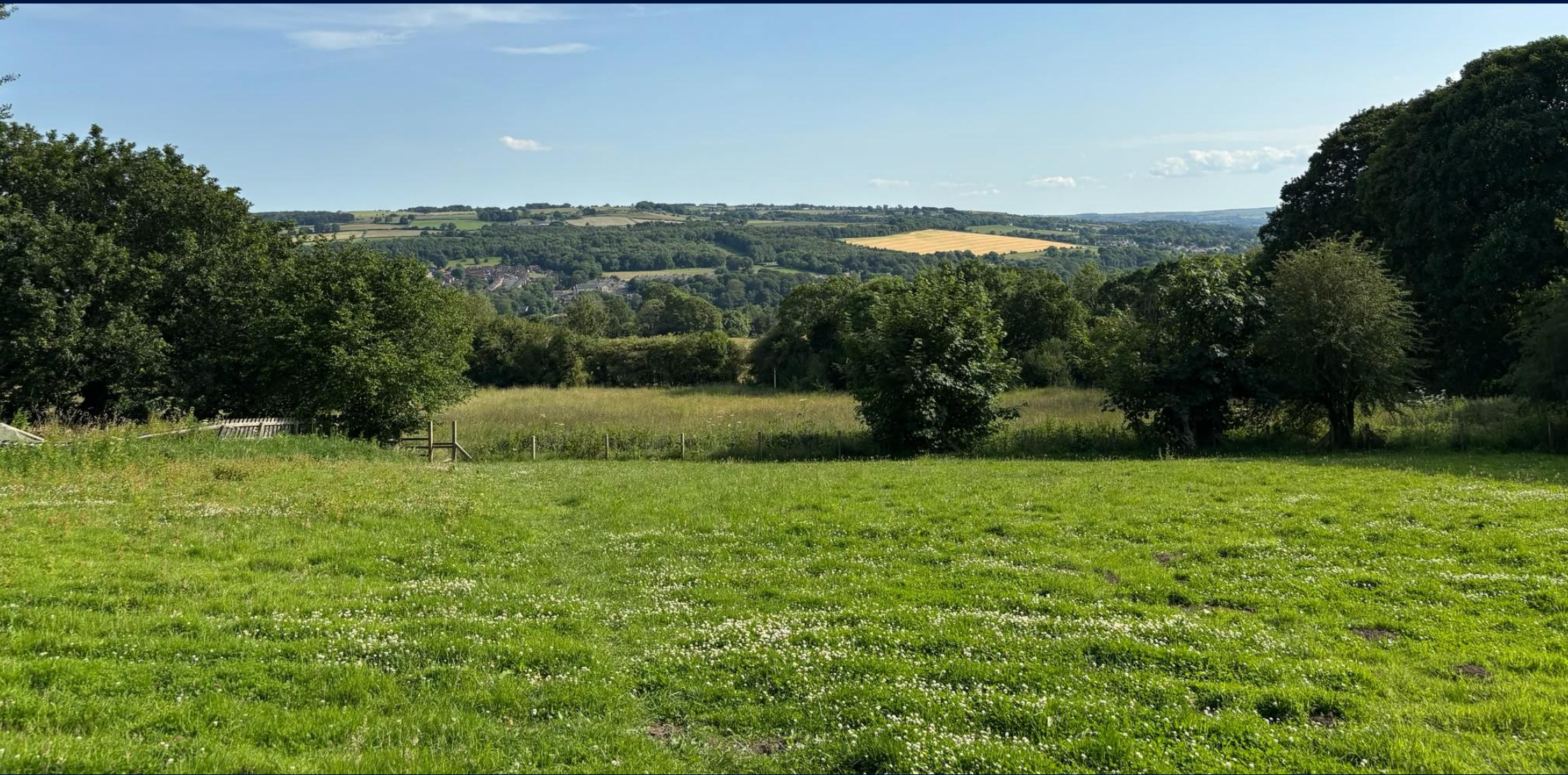
Land at South View Chopwell, Newcastle Upon Tyne, NE17 7JY