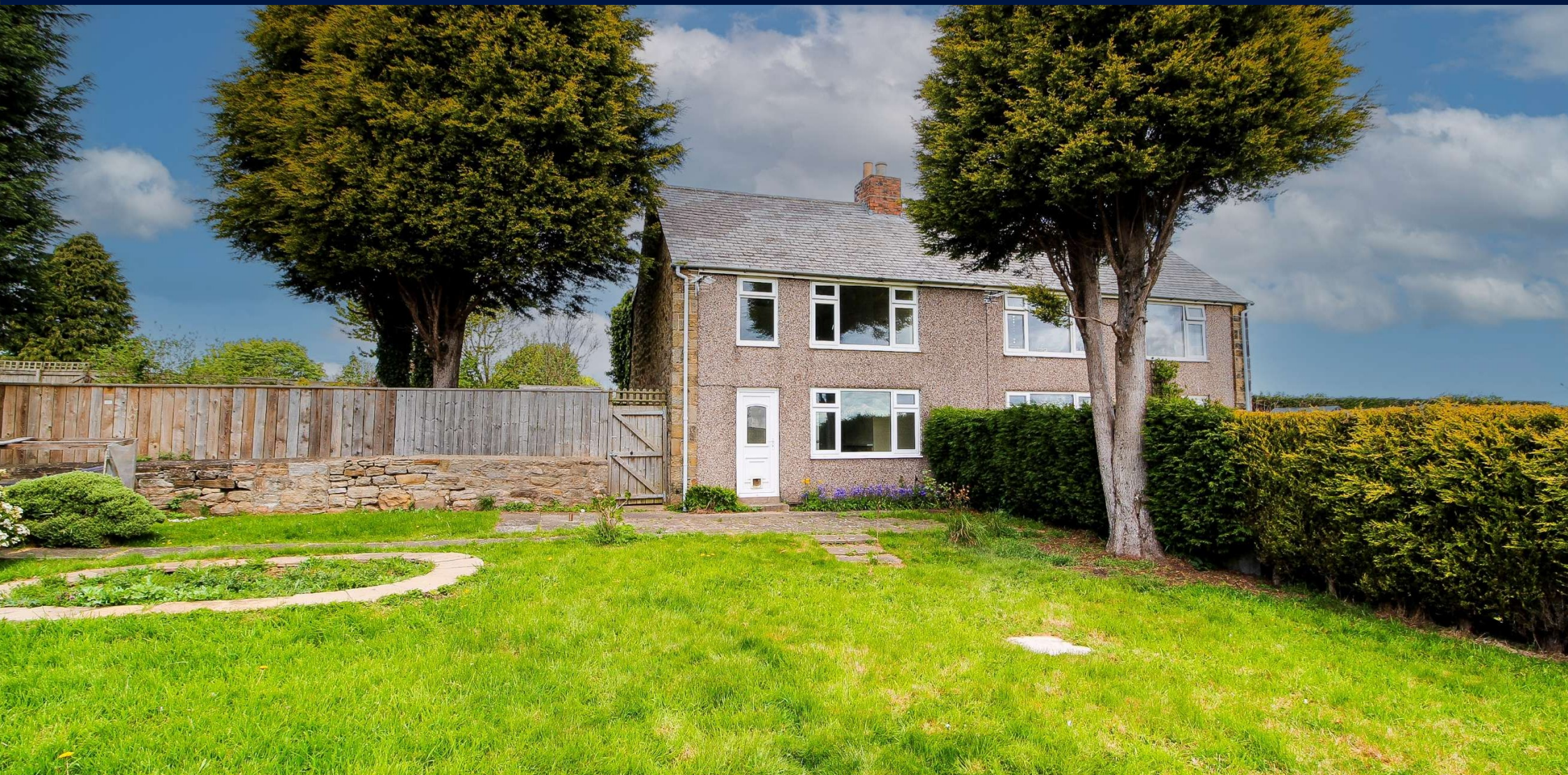
1 EAST FARM COTTAGE, BLACK CALLERTON, NEWCASTLE UPON TYNE TYNE AND WEAR, NE5 1NS