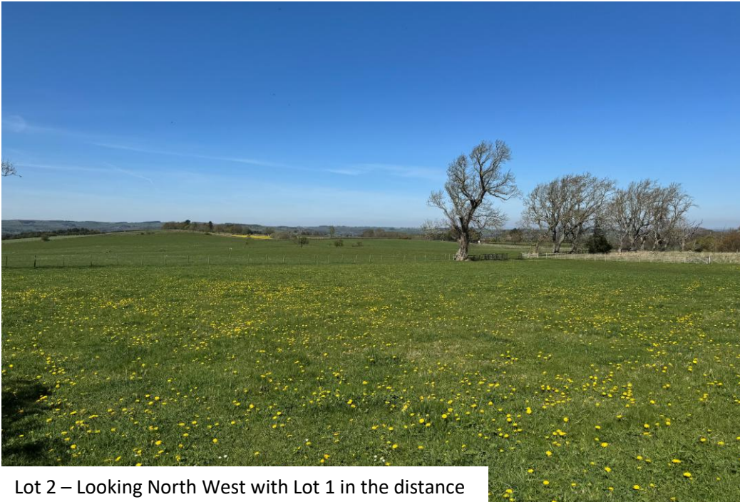
Lot 2 – Looking North West with Lot 1 in the distance