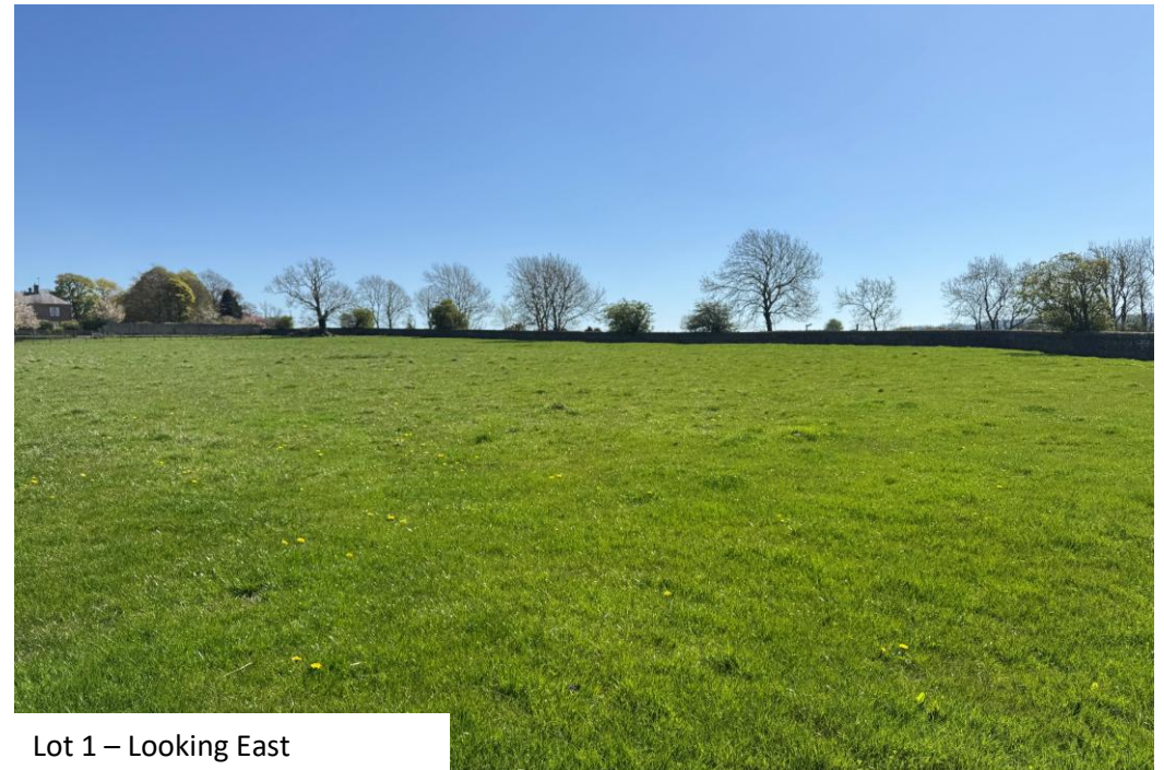
Lot 1 – Looking East

The vendors wish to impose a clawback within the sales contract over the striped area of lot 2, as shown on the sale plan, amounting to 25% of any uplift in value on sale as a result of planning permission for purposes other than agriculture or equestrian use for a period of 25 years from the date of completion.