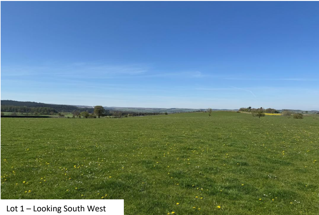
Lot 1 – Looking South West