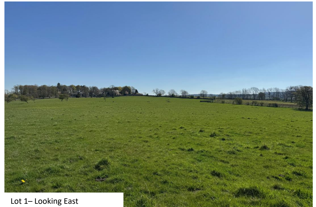
Lot 1- Looking East