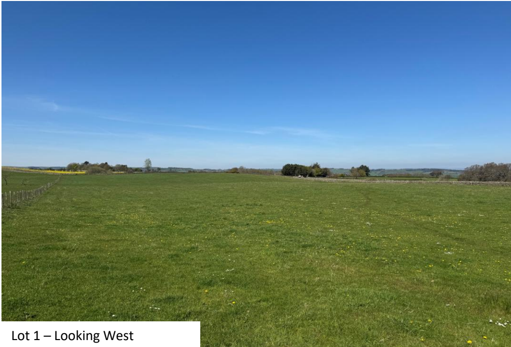
Lot 1 – Looking West