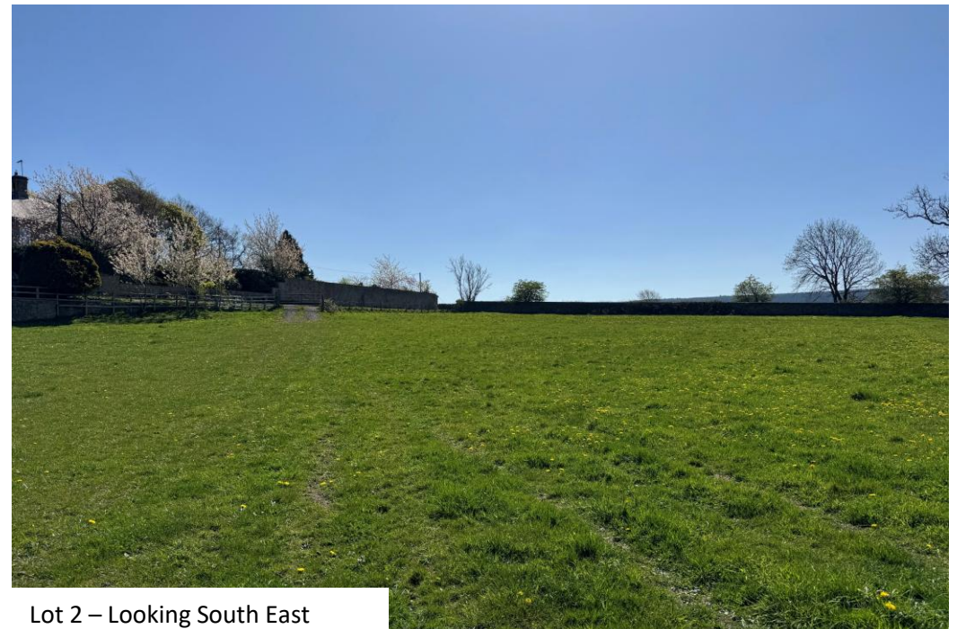
Lot 2 – Looking South East