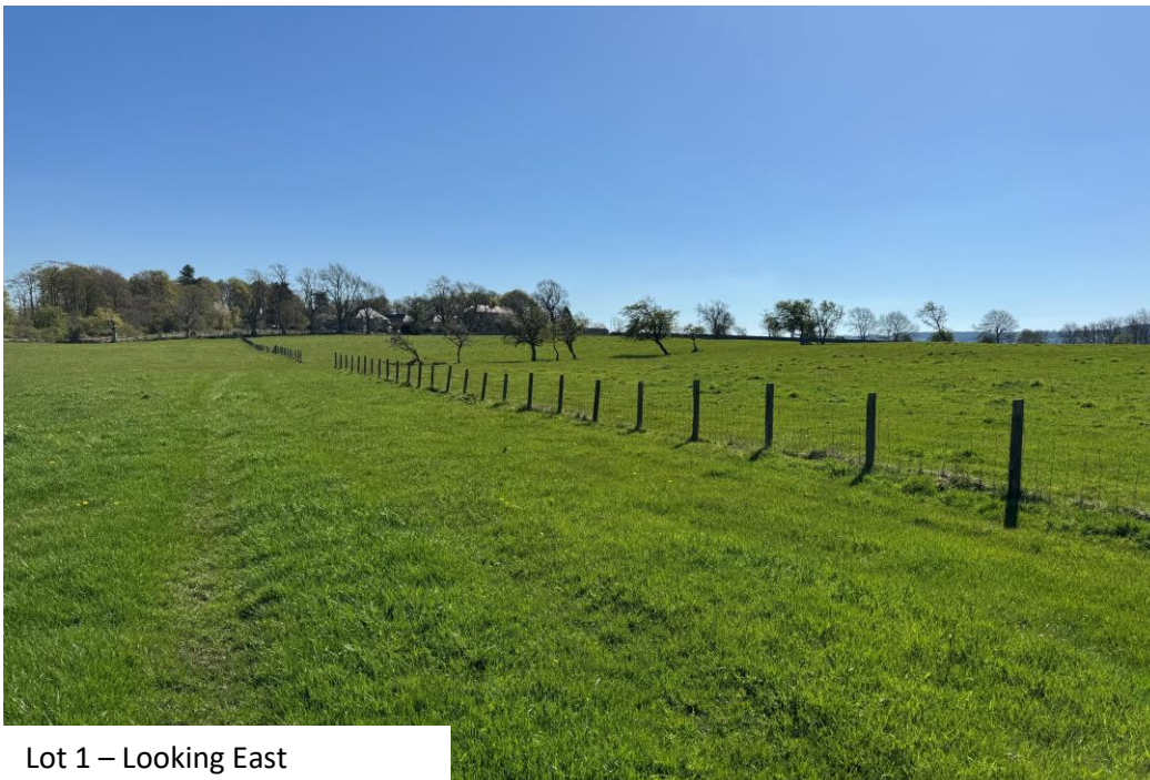
Lot 1 – Looking East