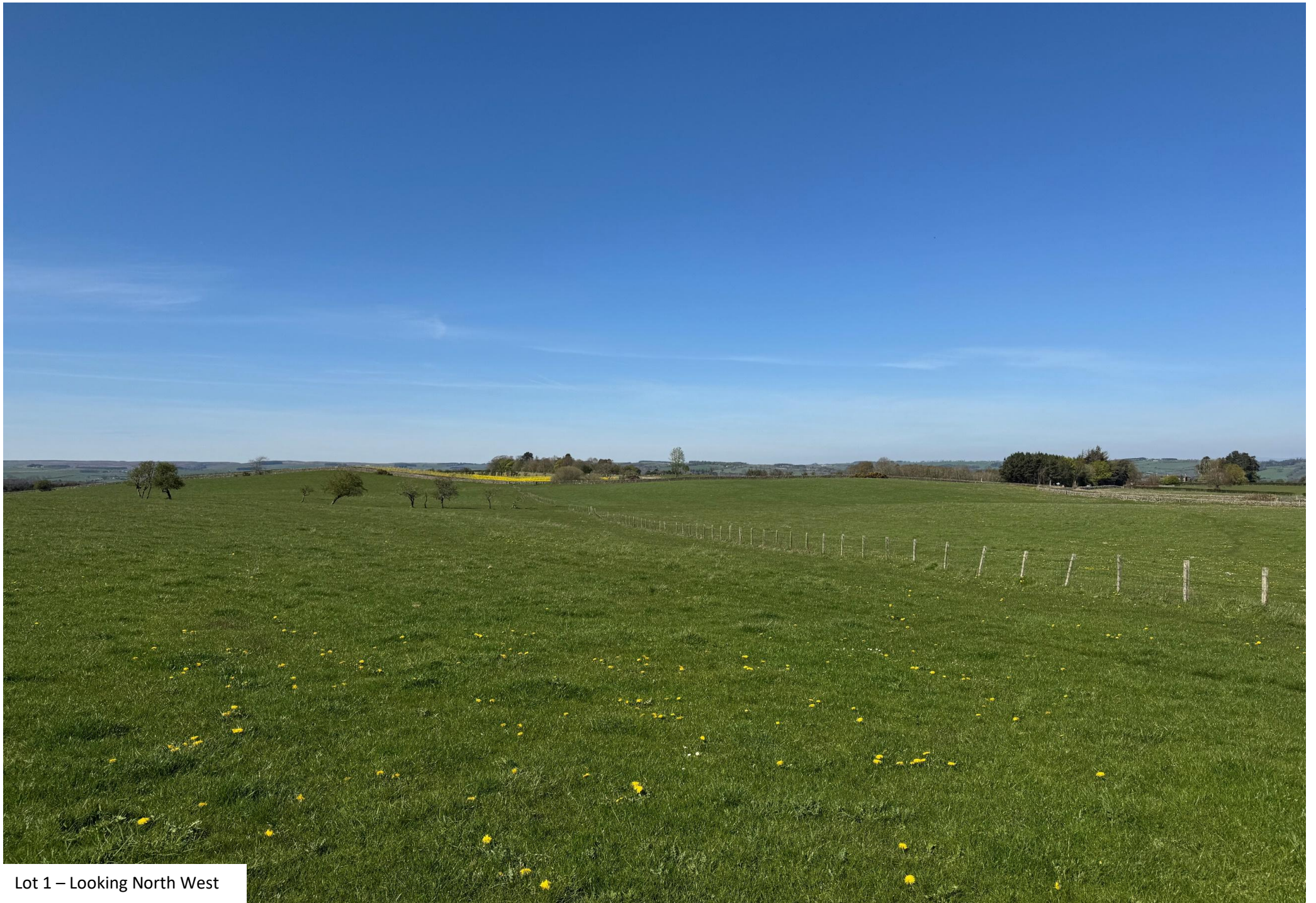
Lot 1 – Looking North West