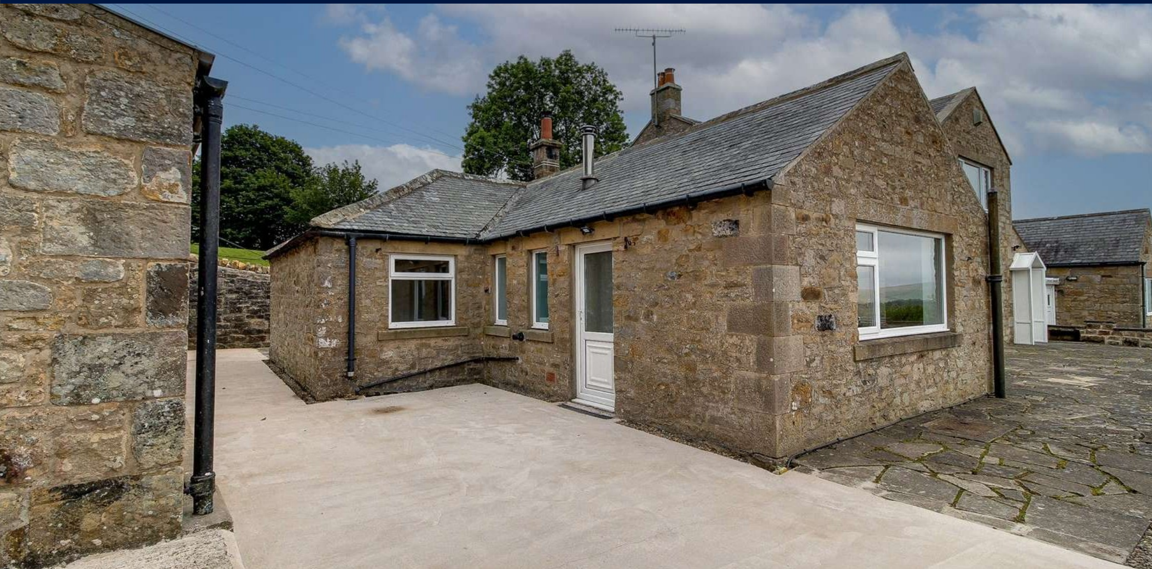
5 FOUNDRY YARD, RIDSDALE HEXHAM, NORTHUMBERLAND, NE48 2TG