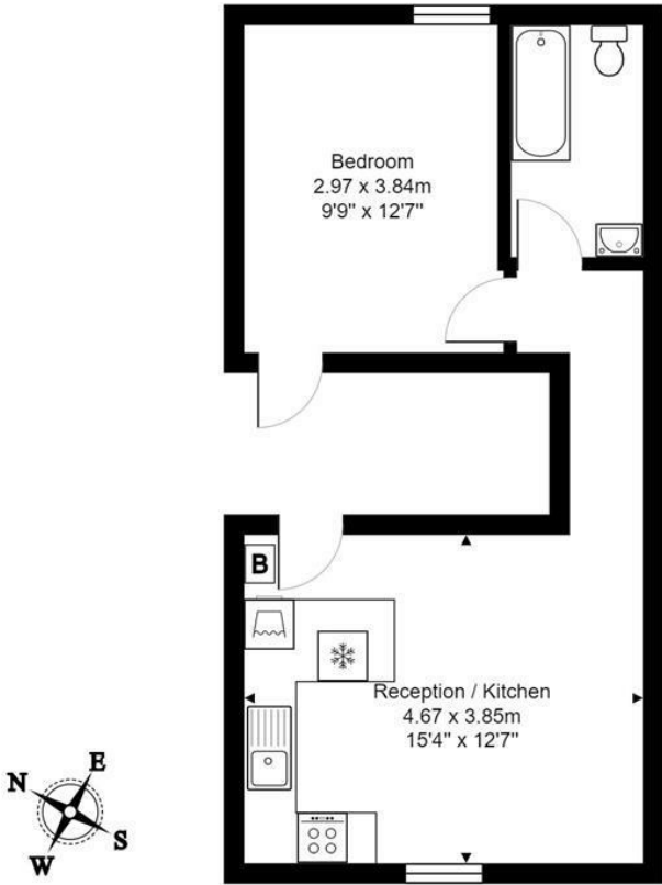
Second Floor Area: 37.7 m 2 ... 406 ft 2