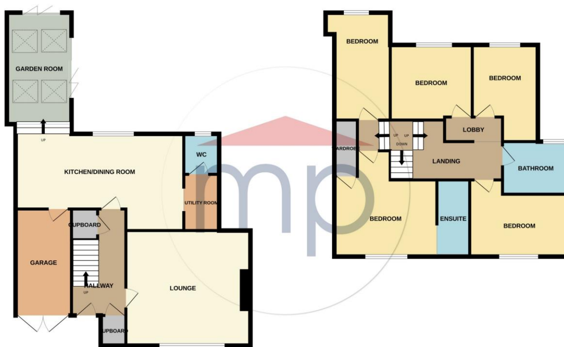
TOTAL FLOOR AREA: 1721 sq.ft. (159.9 sq.m.) approx.

Whilst every attempt has been made to ensure the accuracy of the floorplan contained here, measurements of doors, windows, rooms and any other items are approximate and no responsibility is taken for any error, omission or mis-statement. This plan is for illustrative purposes only and should be used as such by any prospective purchaser. The services, systems and appliances shown have not been tested and no guarantee as to their operability or efficiency can be given. Made with Metropix ©2024