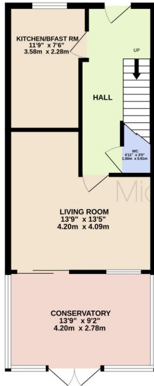
GROUND FLOOR 473 sq.ft. (43.9 sq.m.) approx.