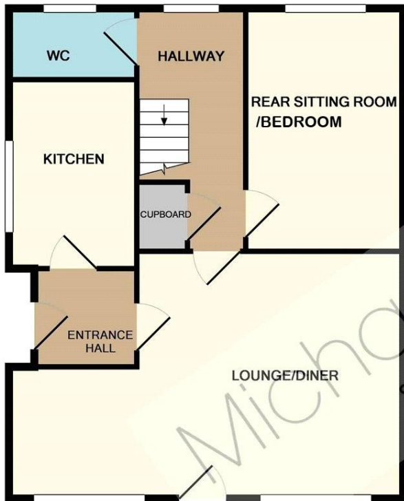
GROUND FLOOR APPROX. FLOOR AREA 705 SQ.FT. (65.5 SQ.M.)