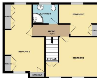
TOTAL FLOOR AREA: 1035 sq.ft. (96.2 sq.m.) approx.

Whilst every attempt has been made to ensure the accuracy of the floorplan set out here, measurements of these details, views and any other items are approximate and no responsibility is taken for any error, omission or mis-statement. This plan is for illustrative purposes only and should not be used as such for any prospective purchase. The services, systems and appliances shown have not been tested and no guarantee as to their operability or efficiency can be given. Made with Blueprints 10/2020