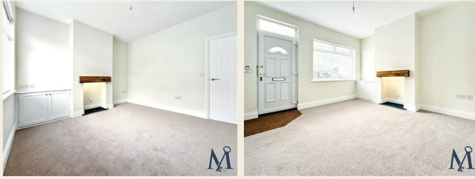
Rear Reception Room 12'0" x 11'8" (3.66m x 3.56m)