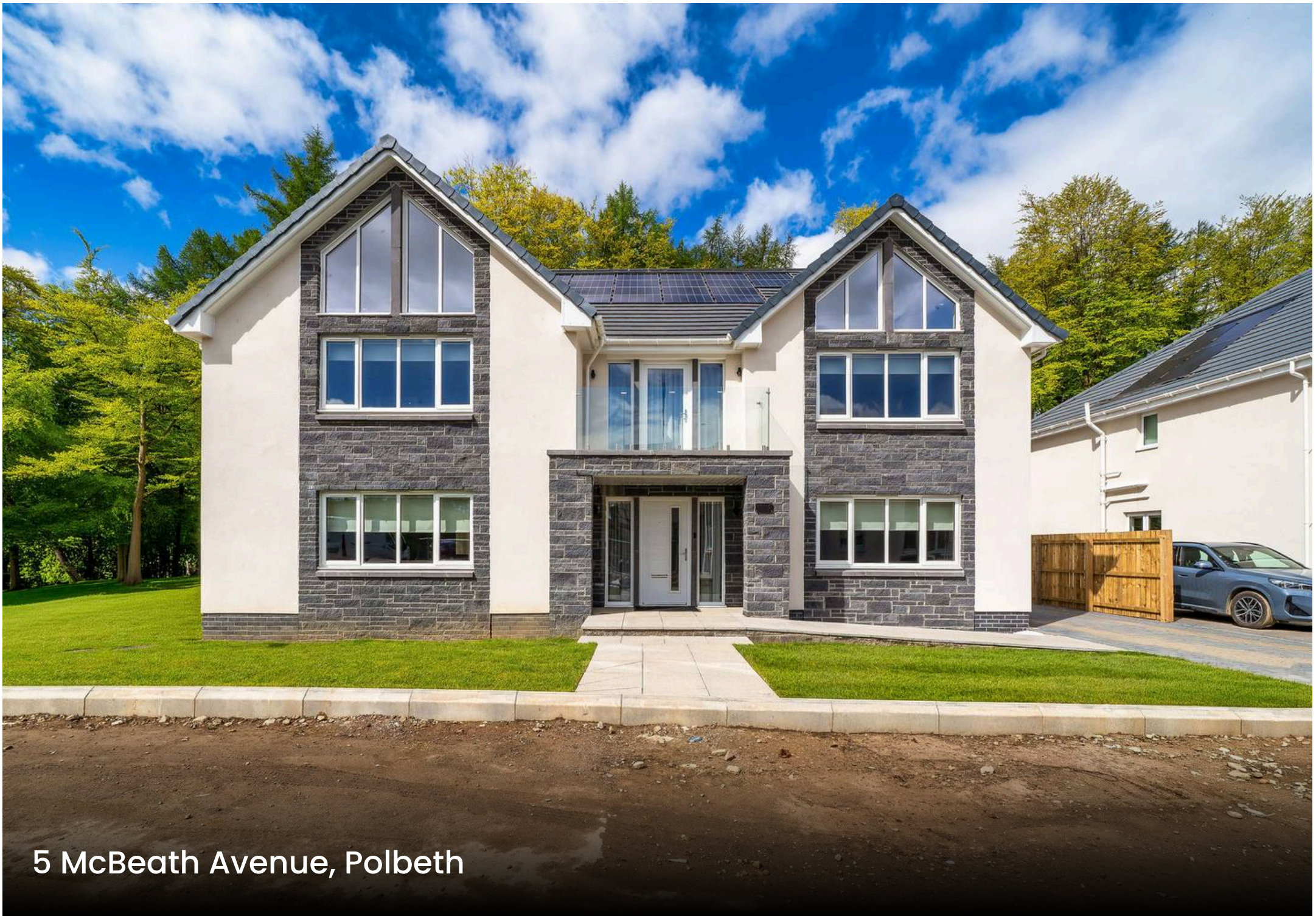
5 McBeath Avenue, Polbeth