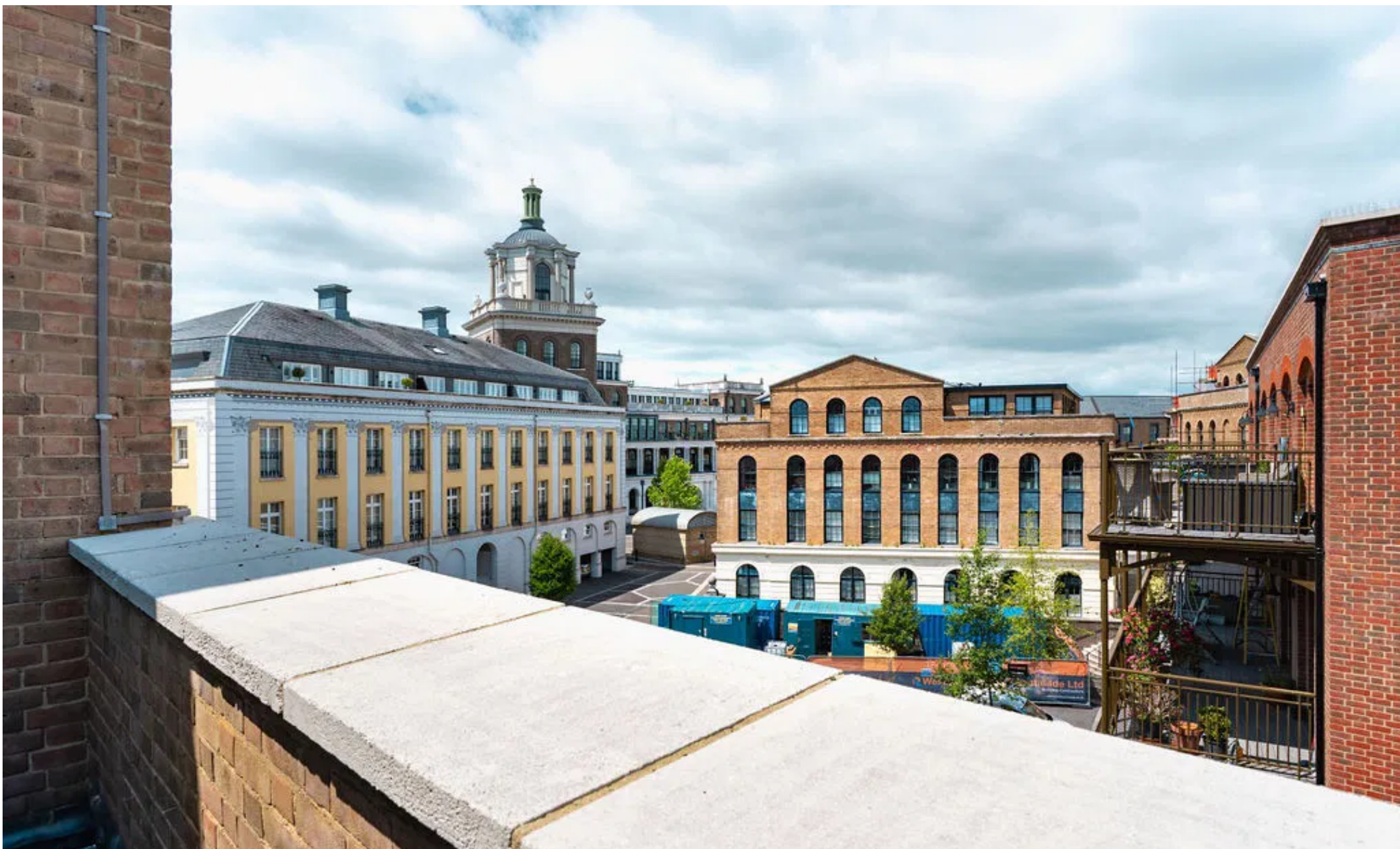
Bowes Lyon Place, Poundbury, Dorchester, DT1 3DA