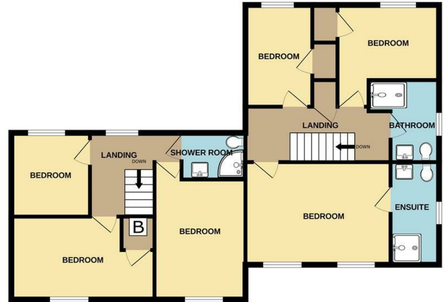
TOTAL FLOOR AREA : 2022 sq.ft. (187.8 sq.m.) approx.

Whilst every attempt has been made to ensure the accuracy of the floorplan contained here, measurements of doors, windows, rooms and any other items are approximate and no responsibility is taken for any error, omission or mis-statement. This plan is for illustrative purposes only and should be used as such by any prospective purchaser. The services, systems and appliances shown have not been tested and no guarantee as to their operability or efficiency can be given.