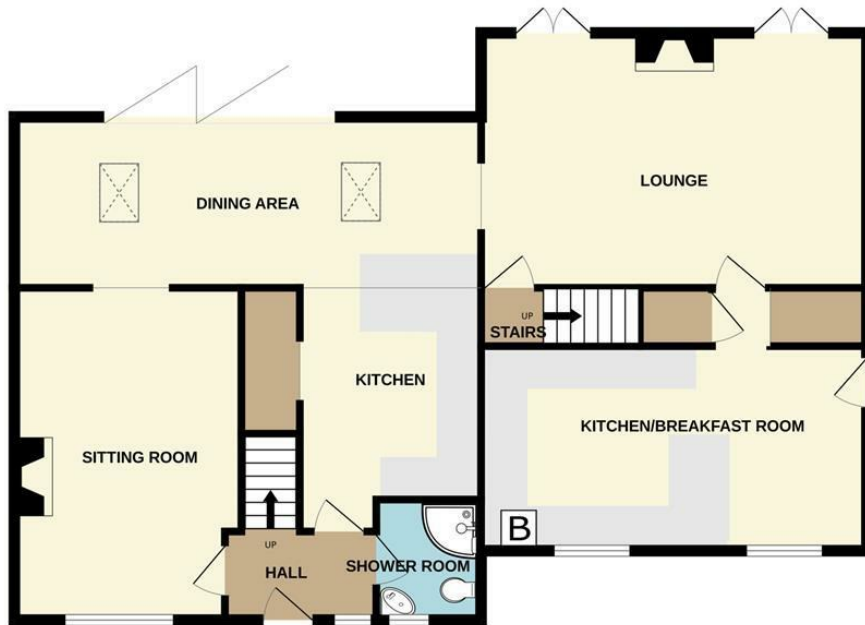
GROUND FLOOR 1107 sq.ft. (102.9 sq.m.) approx.