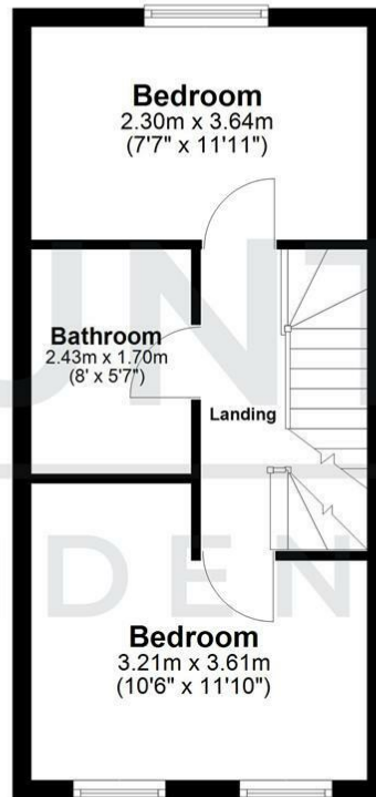
First Floor Approx. 29.5 sq. metres (318.0 sq. feet)