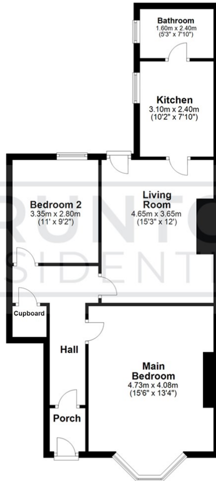
Ground Floor Approx. 69.6 sq. metres (749.1 sq. feet)

All measurements are approximate and are for illustration only. Plan produced using PlanUp.