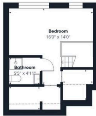
Floor 3 Building 1