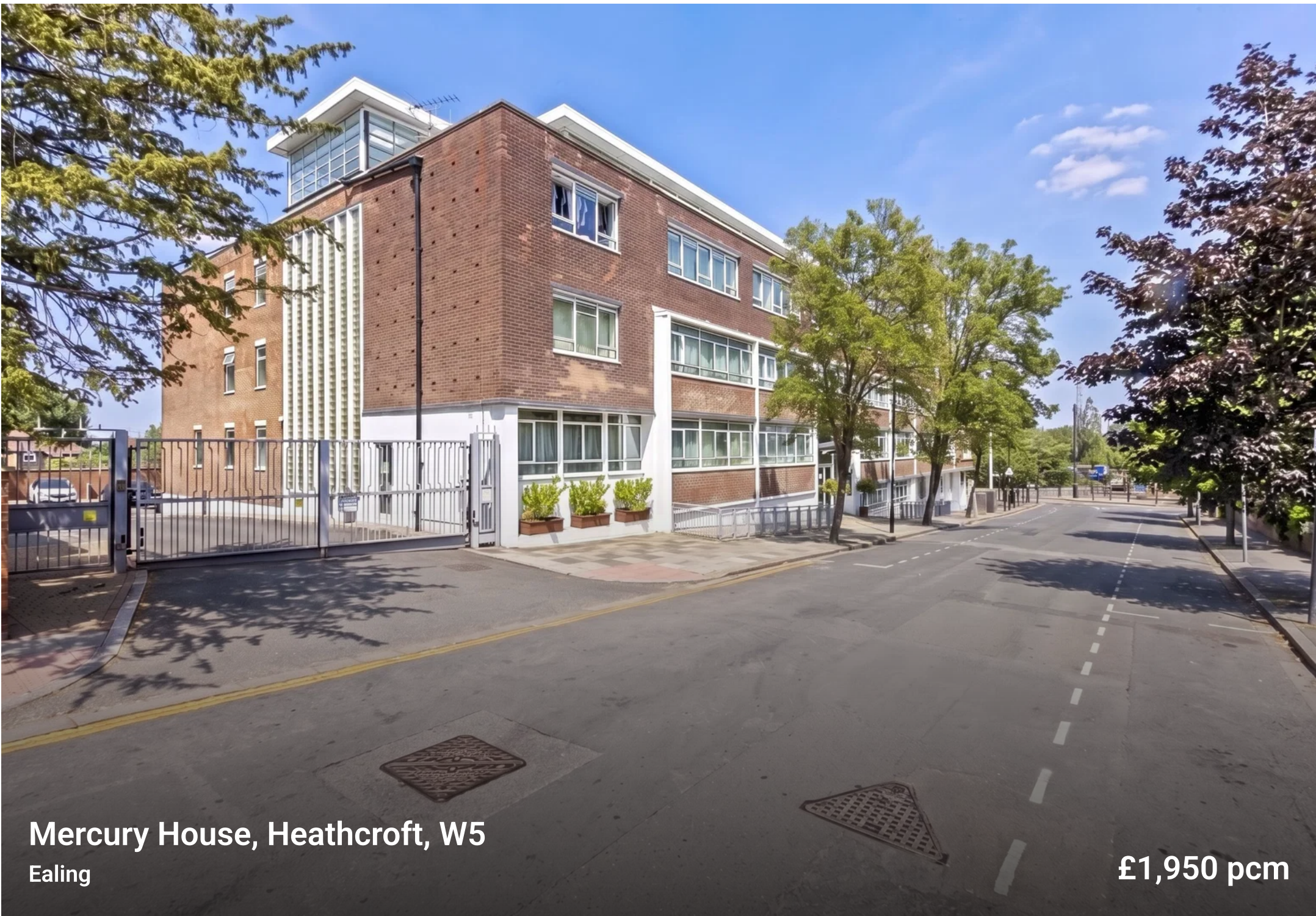
Mercury House, Heathcrot, W5 Ealing