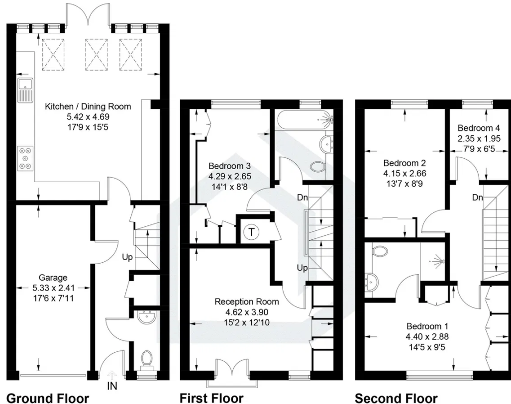
Illustration for identification purposes only, measurements are approximate, not to scale. Fourlabs.co © (ID1268866)