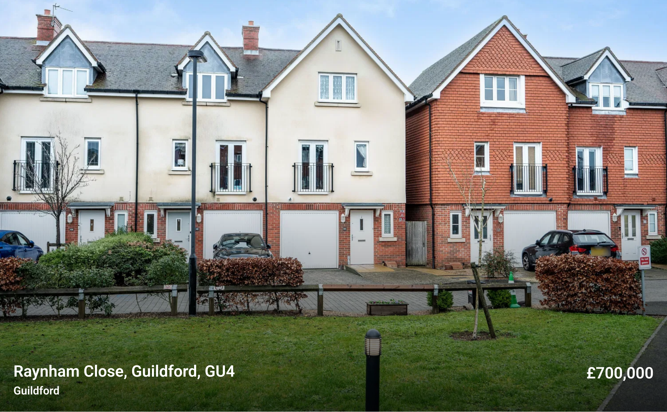
Raynham Close, Guildford, GU4 Guildford