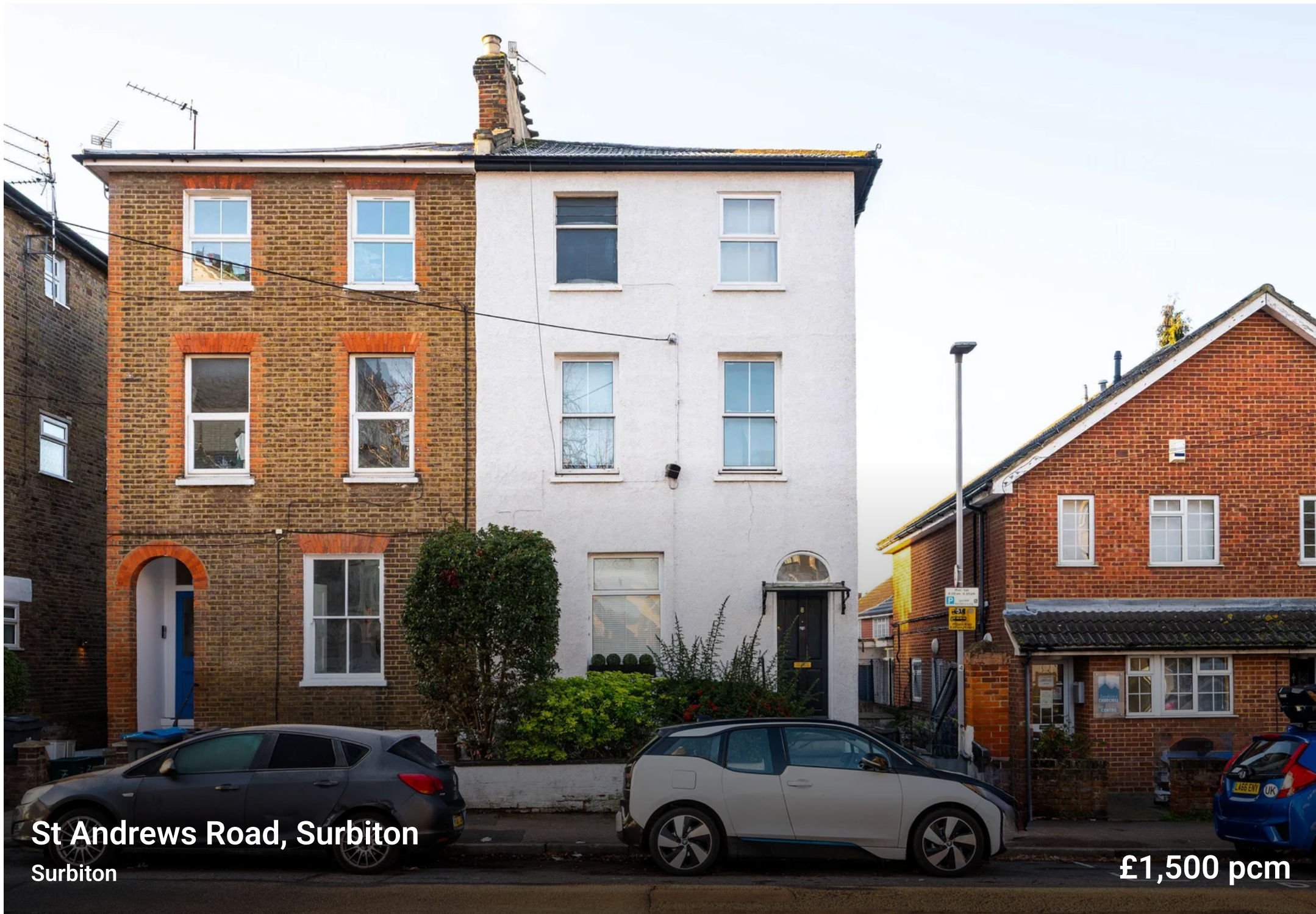
St Andrews Road, Surbiton Surbiton