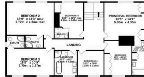
1ST FLOOR 1056 sq.ft. (97.6 sq.m.) approx.