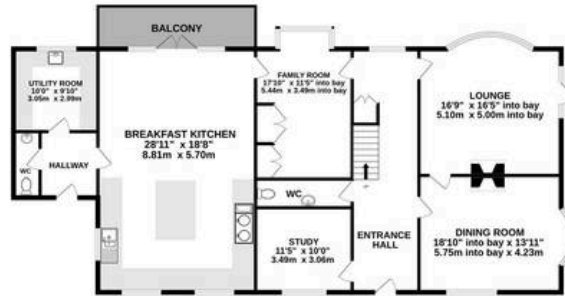
GROUND FLOOR 1783 sq.ft. (164.4 sq.m.) approx.