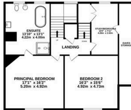
1ST FLOOR 1343 sq.ft. (124.0 sq.m.) approx.