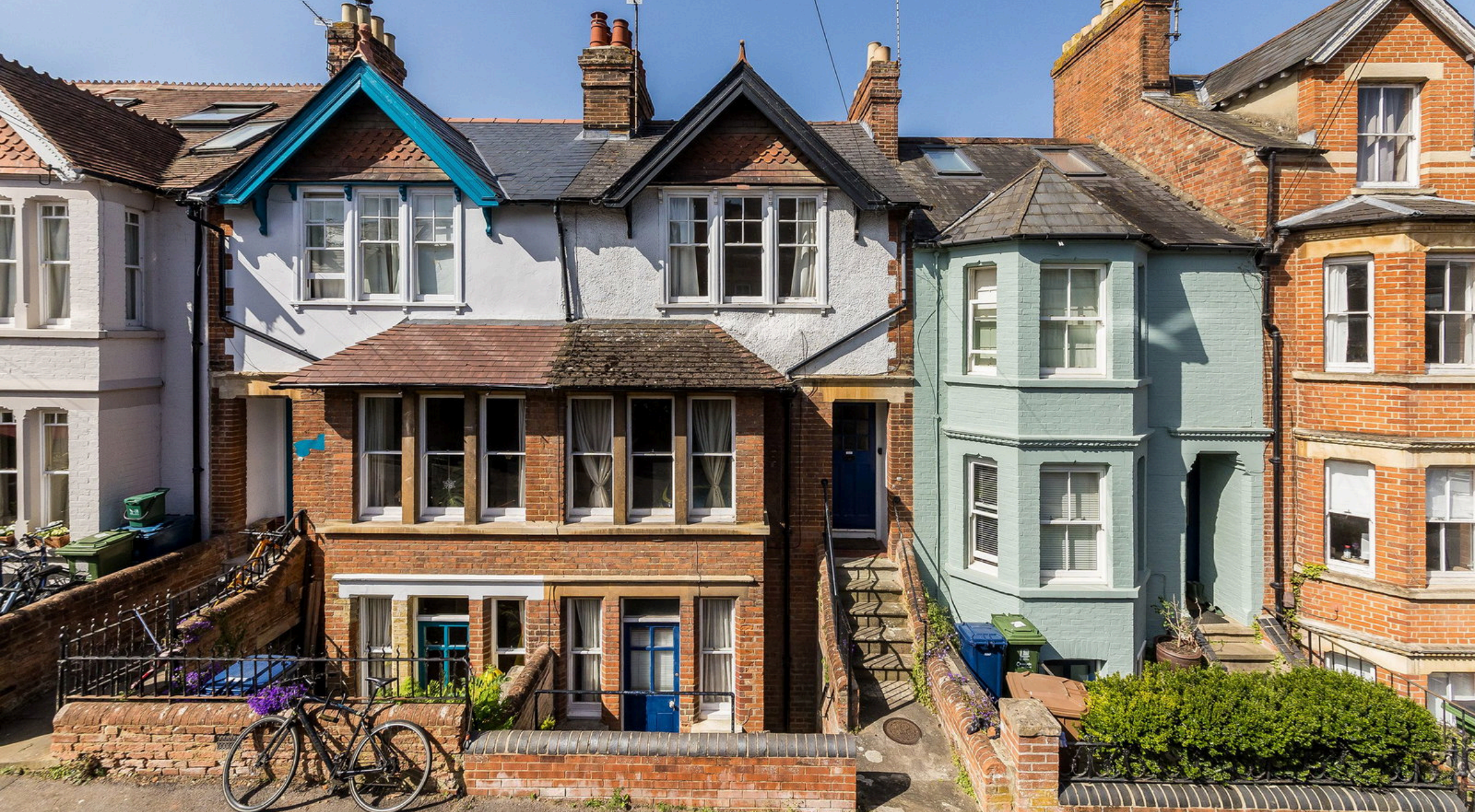
Argyle Street, Iffley Fields, OX4