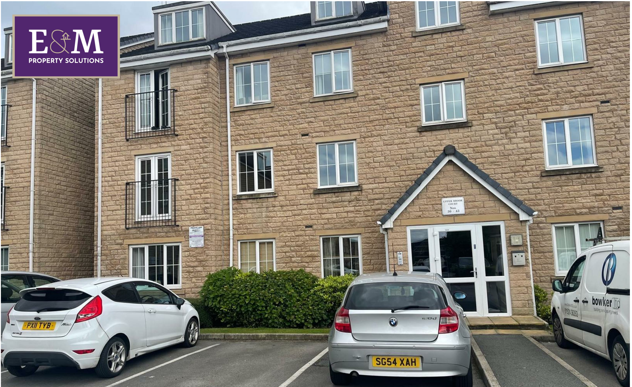
38 Upper Brook Court Greenbrook Road, Burnley, BB12 6PY Asking price £92,000