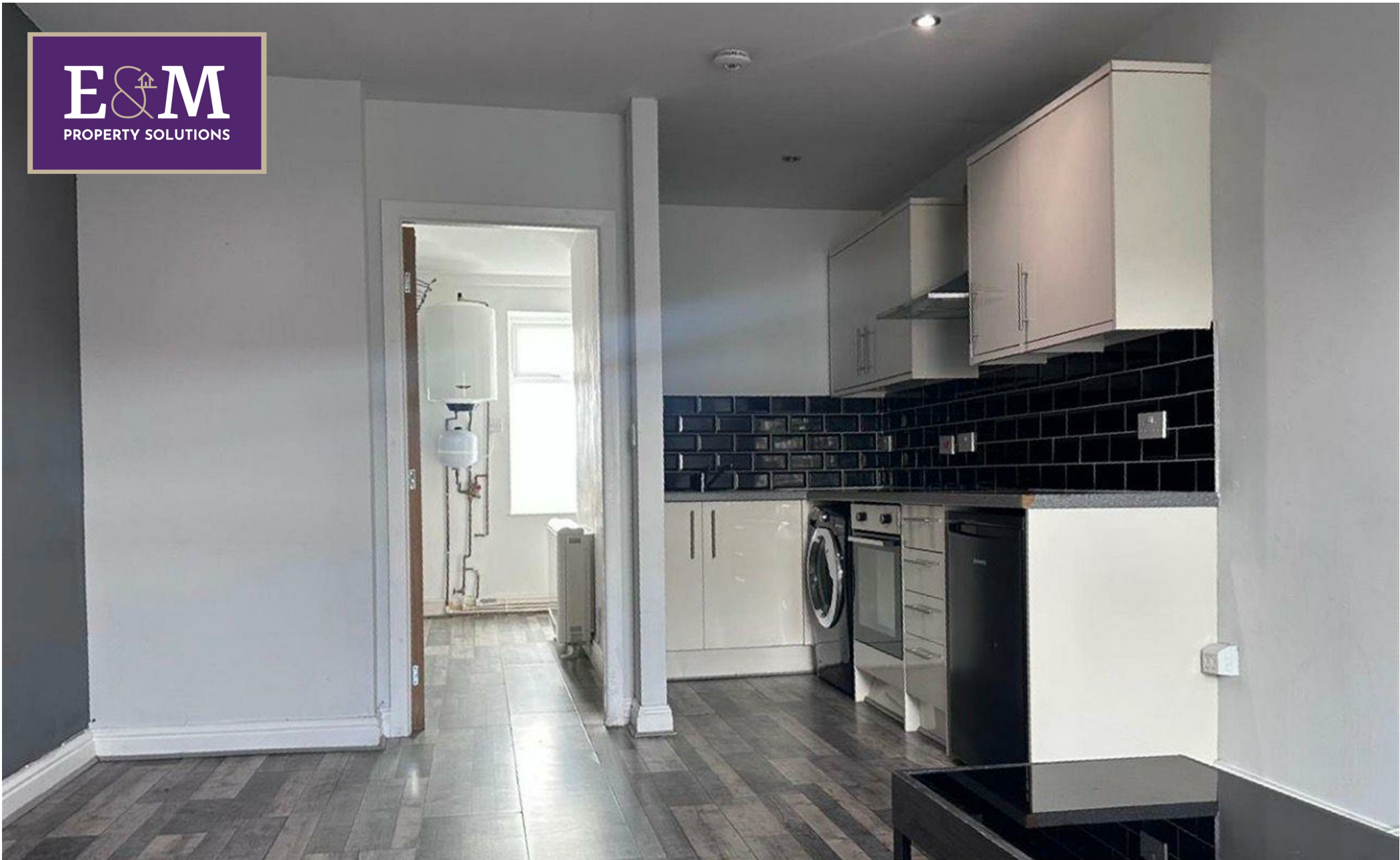
Flat 2, 87-91 Coal Clough Lane, Burnley, BB11 4NS £130 Per week