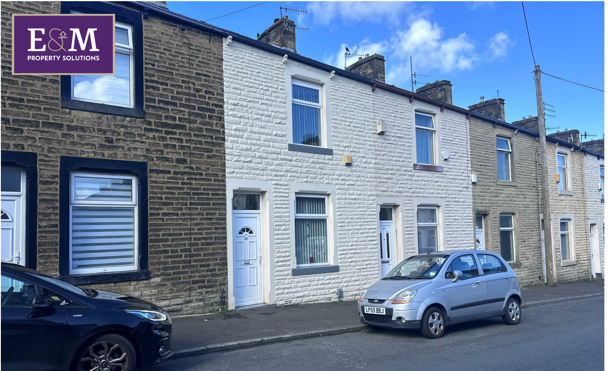
13 Ulster Street, Burnley, Lancashire, BB11 4NX Offers in the region of £75,000